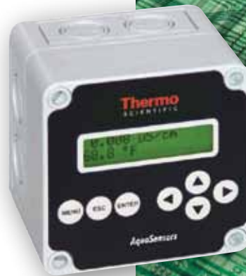
AV88 AnalogPlus Universal Analyzer Shown with NEMA 4X Enclosure